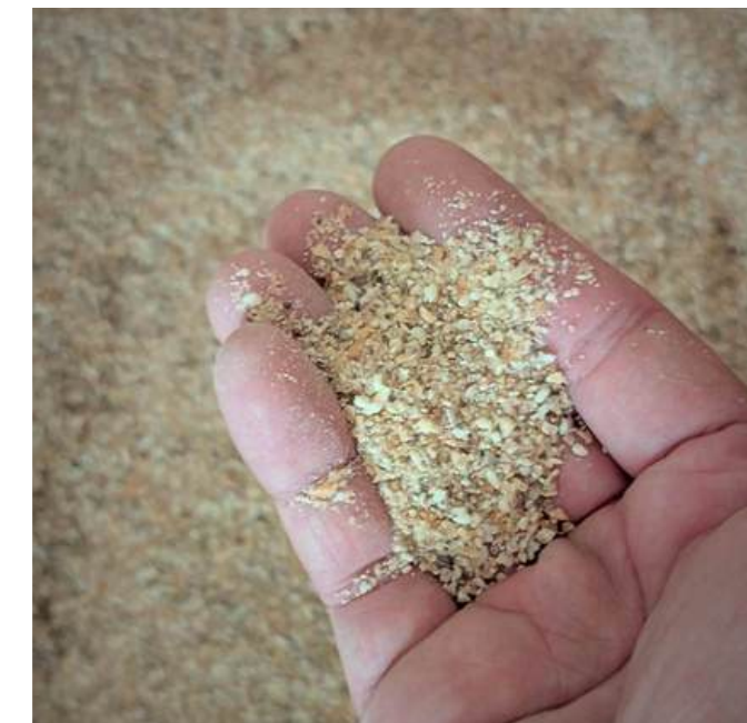
Gum Benzoin Dust