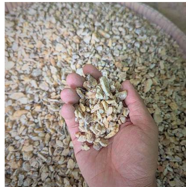
Gum Benzoin Grade B