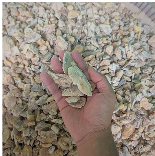
Gum Benzoin Grade A

We offer a wide range of gum benzoin grades to cater to different industries and applications. All products are carefully sorted, graded, and quality-checked.