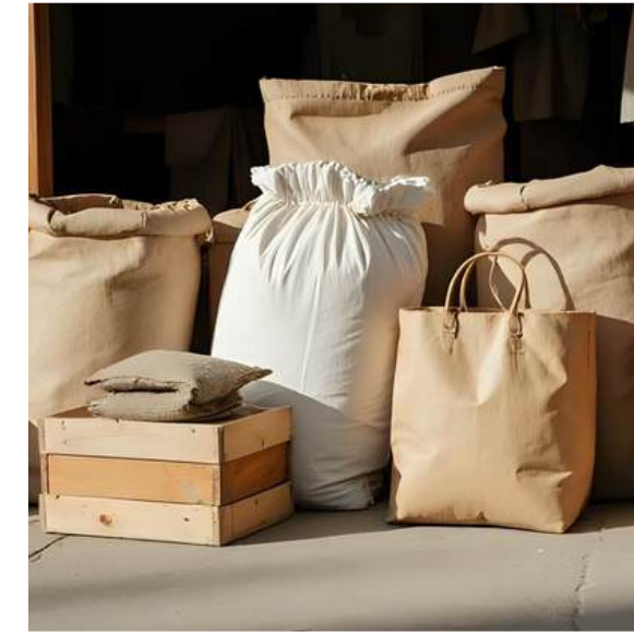
Custom Packaging by Request

“Our standard packing is 25 kg sealed in LDPE Plastic in Cardboard Box or Wooden Crates. Biodegradable Plastic is also available upon request. Let us know if you have special packing requirements — we are happy to accommodate.